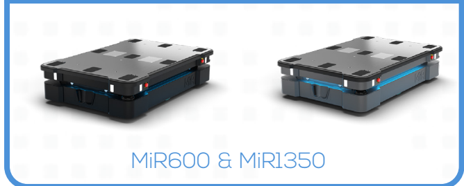
MiR600 & MiR1350