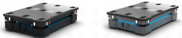
MiR600 & MiR1350