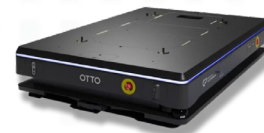
OTTO 1500 V2