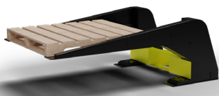
NORD P&D Stand Cantilever 1200 V1 - OTTO 1500