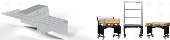
Gates & Shelf Cart