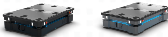
MiR600 & MiR1350