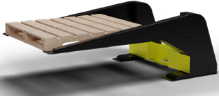
Nord P&D Stand Cantilever 1200 V1 - OTTO 1500