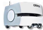
OMRON LD-60, OMRON LD-90 & OMRON LD-90x