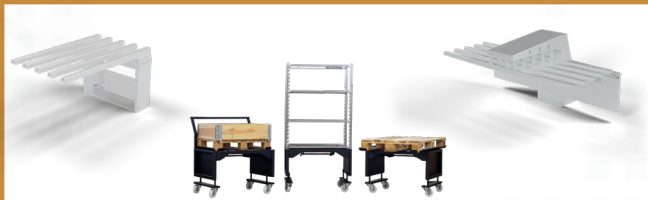
Gates & Shelf Cart