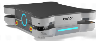
OMRON MD-650 & MD-900