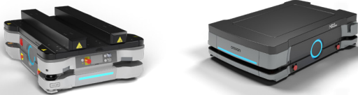
Nord PL-EU (MD / HD) & Nord PL-US (MD / HD)