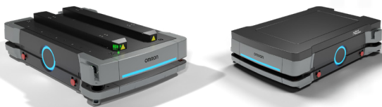
Nord PL-EU & Nord PL-US